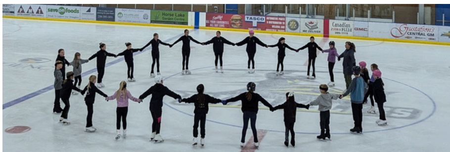
Junior and Senior Synchro